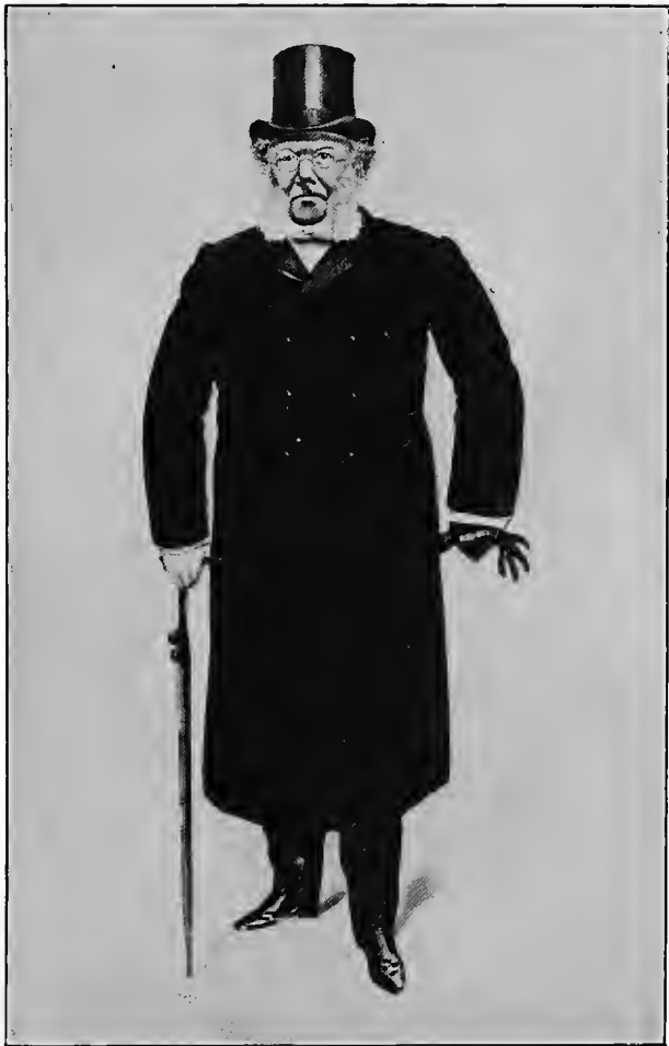
From a drawing by Gustav Laerum.